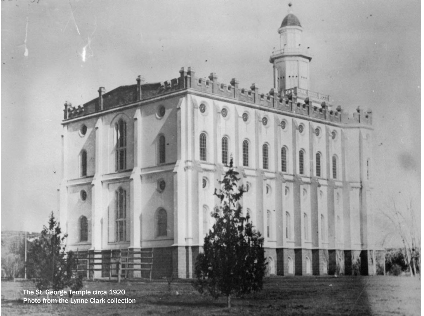
The St. George Temple circa 1920