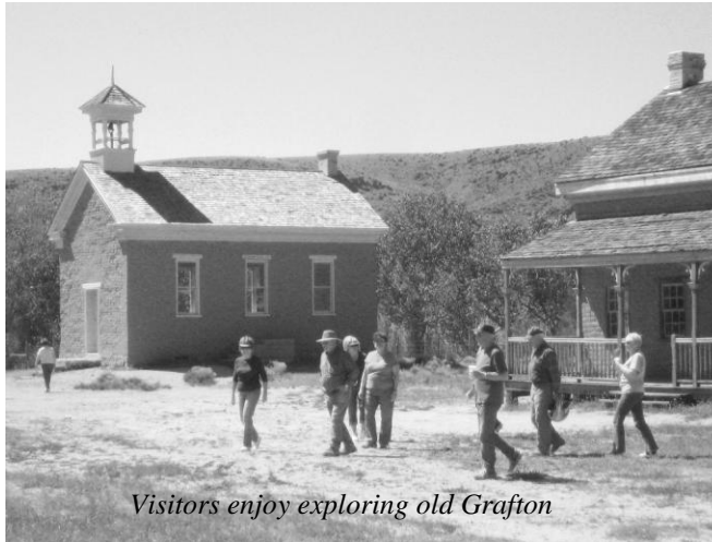
Visitors enjoy exploring old Grafton

The town's people used this building as a school, community meeting place, church as well as a place for dances and plays. People would come from all the settlements on the Upper Virgin River to attend the community dances, which were held on weekends. As was customary with dances in