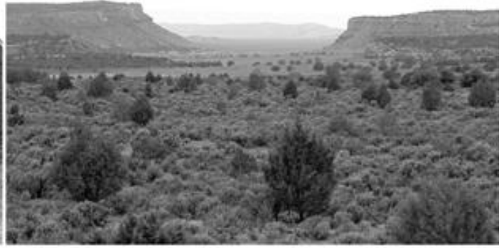
H. Canaan Gap