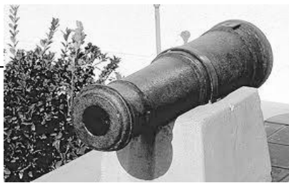
The old Cannon used to pound the foundation stone for the Temple

For more than a year, freight wagons made hundreds of round trips to the temple site with basketball-sized lava rocks. They were pounded over and over with an old cannon until they had solid ground